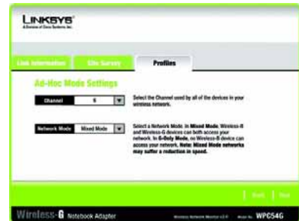
Figure 6-11: Ad-Hoc Mode Settings

Network Mode - Select Mixed Mode, and both Wireless-G and Wireless-B computers will be allowed on the network, but the speed may be reduced. Select G-Only Mode for maximum speed, but no Wireless-B users will be allowed on the network. Select B-Only Mode for Wireless-B users only.